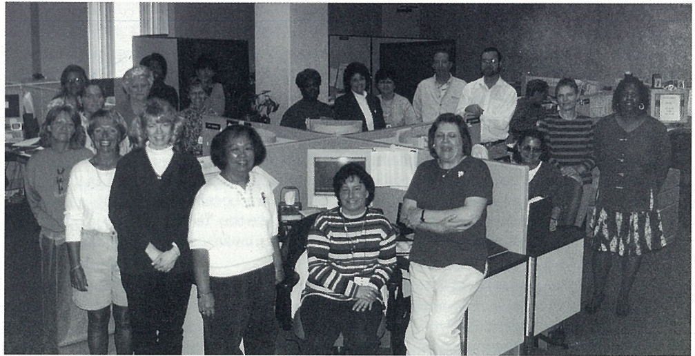
Union members win upgrades downstate.

The Office of Emergency Communications suspended a Police Communications Operator-I member for 30 days for inattention to duty. The union filed an appeal before the City of Chicago Personnel Board on grounds of excessive disciplinary action. The hearing judge agreed and the suspension was reduced to